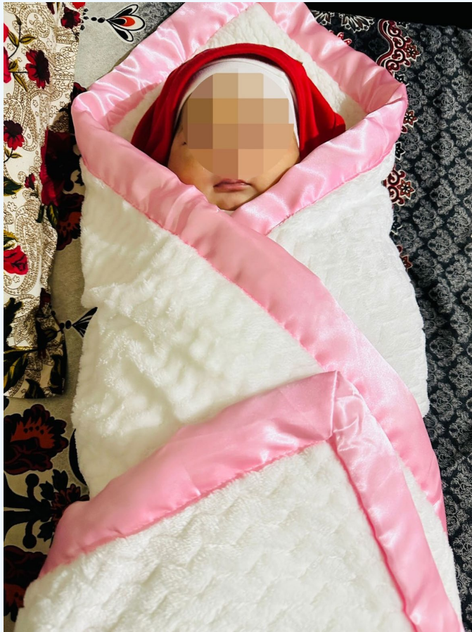
Ignore the pink blanket - it's a boy! :)

Please pray for these little ones and their families.