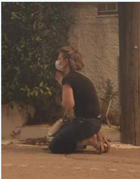
A woman prays as she watches her house burn.

"I think the time of the apocalypse has arrived. Terrible and bad times. There are fires everywhere. In the street is full of soot. I left my window open last night, today there is ash everywhere inside my room. It is a very bad and scary situation. May God protect us all."