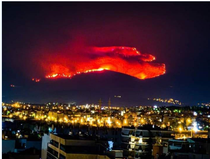
huge wildfire burning in the mountains that surround Athens

everyone at ICC is safe, but they are scared by the scale of what's happening.