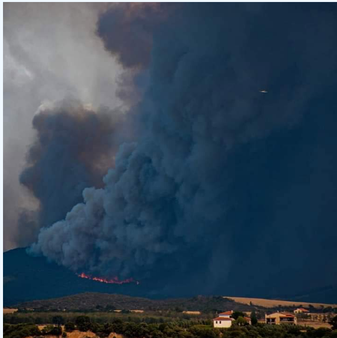
Just one of the many fires burning in Greece this week

During the first five days of the past week alone, 355 wildfires broke out. With winds of 7-8 Beaufort blowing