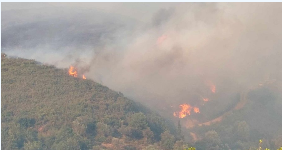
fires starting very close to Goshen

It was a long and scary week, but glory to God, the flames did not reach Goshen and we were unharmed.