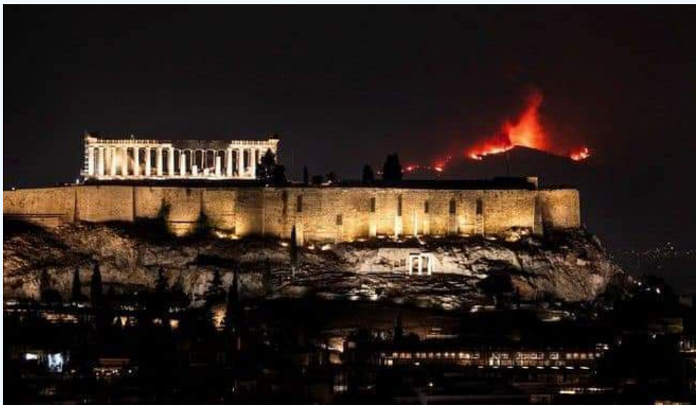
Fires burn behind the Acropolis in Athens (fire is still burning today)

One of the ICC team is from a village in Evia. We asked him if his village