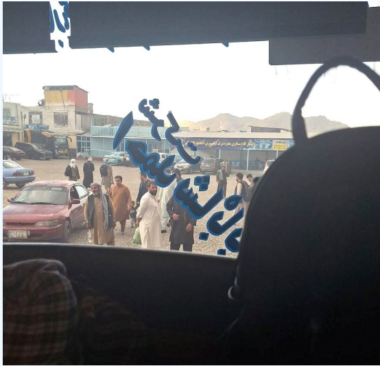
On the bus on the way back to Iran

She had to very quickly escape back to Iran before the family members handed her over to the Taliban.